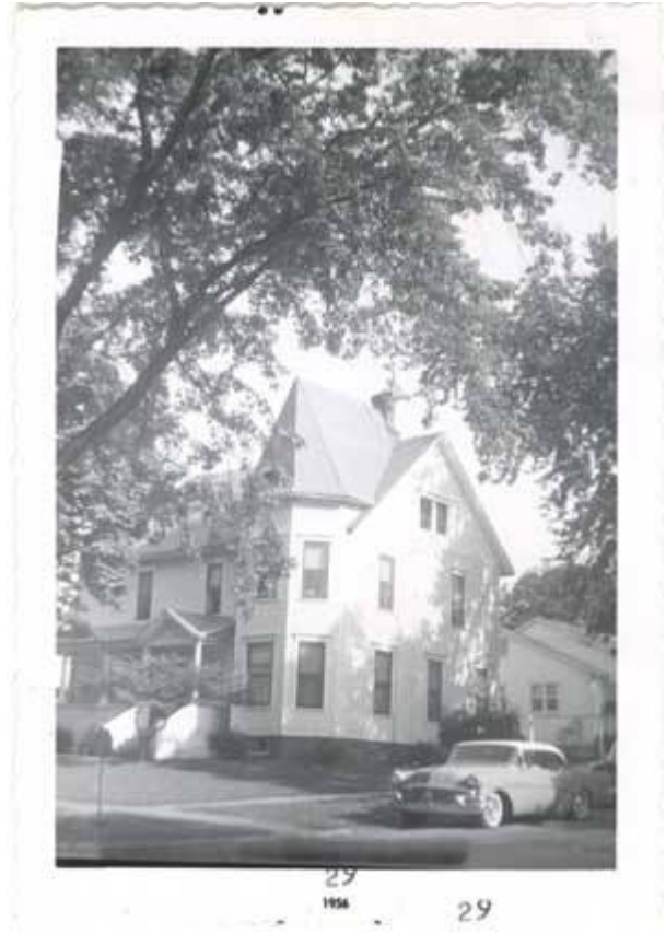
to Id: 128Broadway